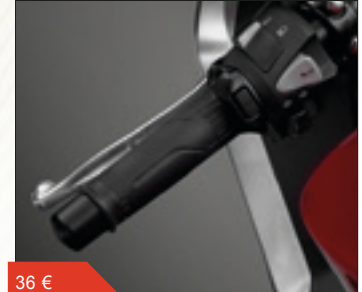
Connecting harness for heated grips.