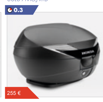
Kit includes 39L top box and backrest, rear carrier, plus 1-key cylinder inner and body kits.