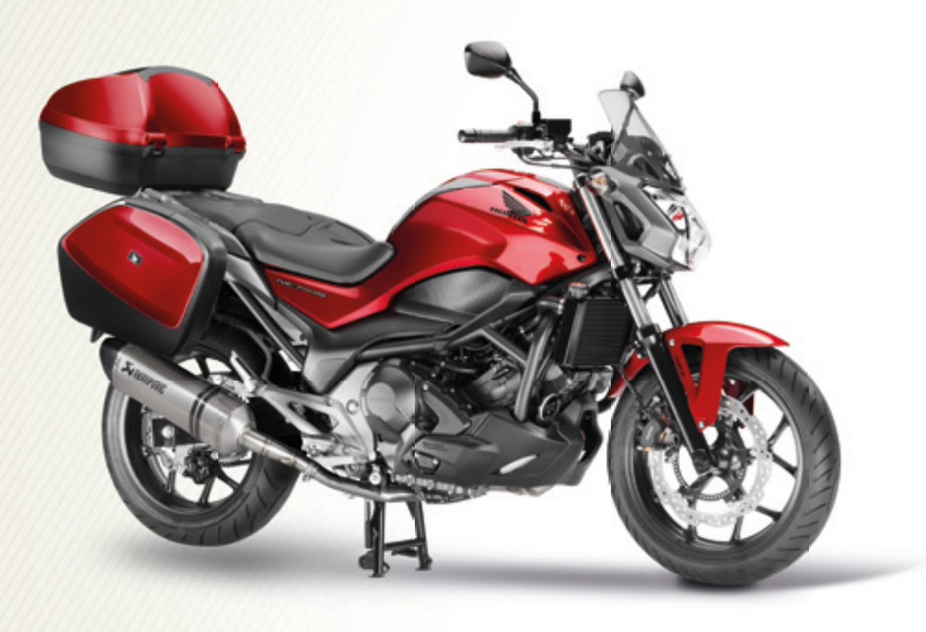
TITANIUM AKRAPOVIC SLIP-ON EXHAUST