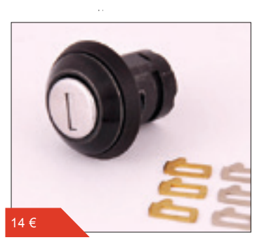
CYLINDER BODY KIT (1-KEY OPERATION) 08885-HAC-P10

Required for 35L top box; cylinder body kit for 1-key operation. To be combined with cylinder inner kit (08885-HAC-POÓ).