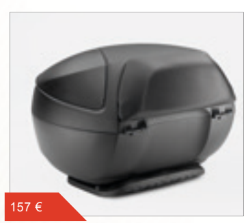
Top box with 39L carrying capacity plus backrest. 1-key operation requires addition of cylinder inner kit (08885-HAC-P00) and cylinder body kit (08885-HAC-P10).