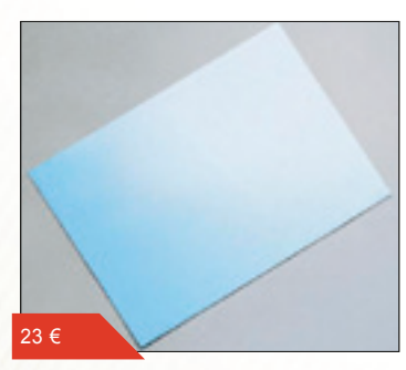
Protects paintwork from scratches; A4-sized, self-adhesive and cut to suit application.