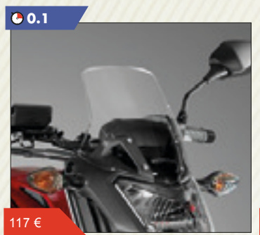
50mm taller and 40mm wider fly screen provides improved wind protection.