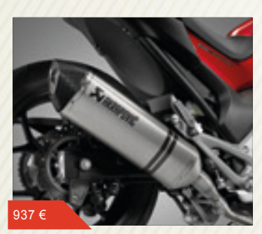
Akrapovic slip-on exhaust with Titanium sleeve, street legal with E1 and TUV approval; can be used with panniers.