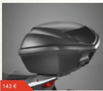
Top box with 35L carrying capacity; can store one full-face helmet, finished in Mat Cynos Grey. 1-key operation requires addition of cylinder inner kit (08885-HAC-P00) and cylinder body kit (08885-HAC-P10). Rear carrier (08L70-MJ-D30) and pannier stay kit (08L74-MGS-J30) are required to fit this accessory.