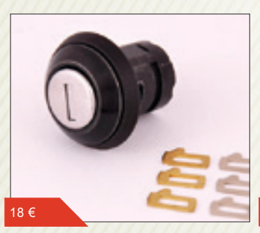
Required for 35L top box; cylinder inner kit for 1-key operation. To be combined with cylinder body kit (08885-HAC-P10).