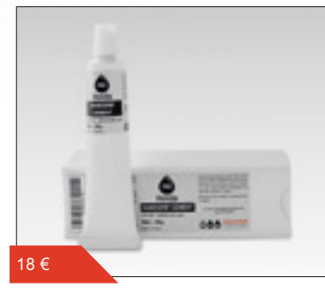
Special heat-resistant glue; recommended for easy and secure installation of heated grips.